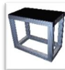
Table Top Only